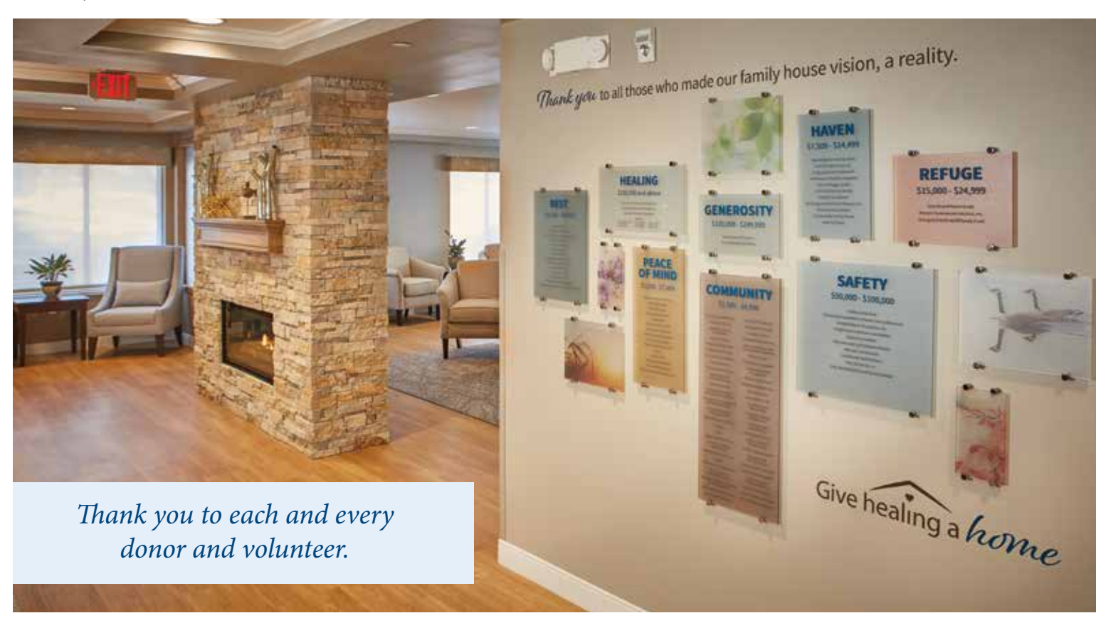
Names of donors are displayed on the Give Healing a Home donor wall at the Aspirus Family House.

To take a virtual tour of the Aspirus Family House, visit www.aspirus.org/family-house-at-aspirus