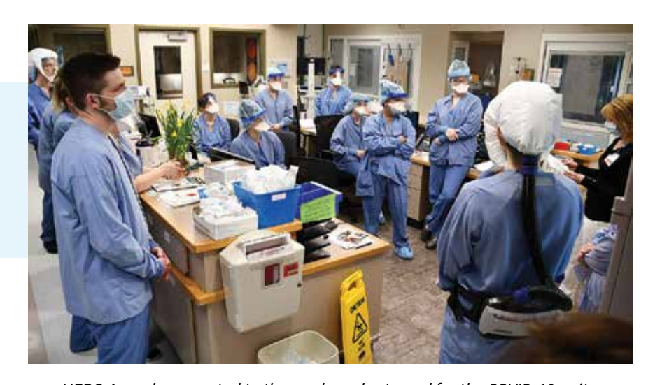
HERO Awards presented to those who volunteered for the COVID-19 unit.

We have seen first-hand the impact these individuals are making on these very sick patients.