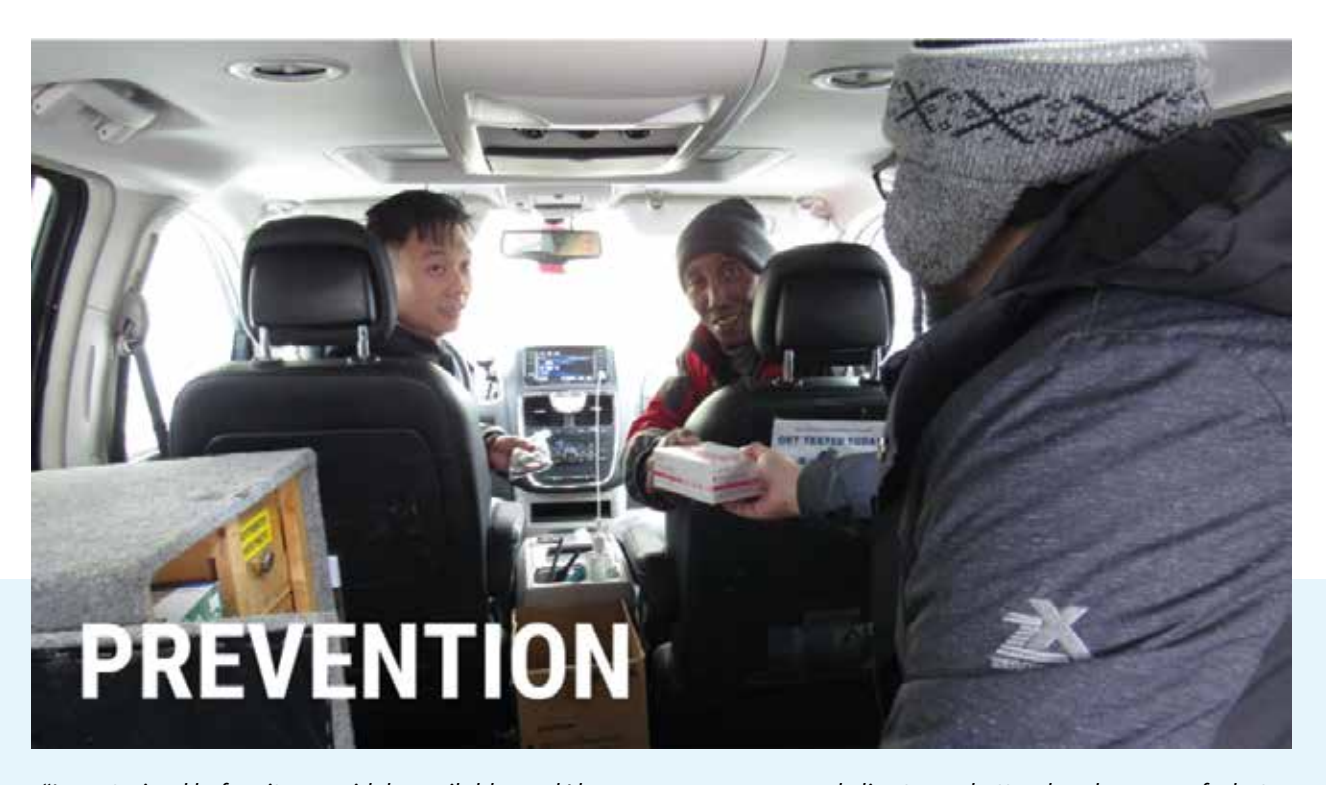
"I was trained before it was widely available, and I have seen so many people live to see better days because of what you guys do and the supplies you make available". - Vivent Health, Prevention Client

Together we are making a difference to continue working to increase access to this lifesaving medication and help get it in the hands of those who can intervene quickly during an overdose emergency.