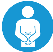
Nausea, Vomiting Diarrhea