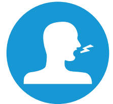
Loss of Taste