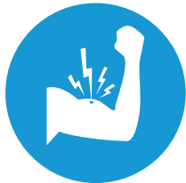
Body and Muscle Aches