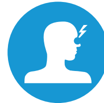
Loss of Smell