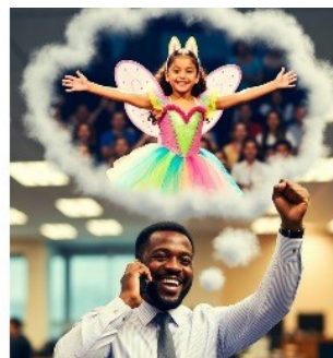
Learn more at: thekeeledeal.com/100-ways-to-make-memories-with-your-kids

W ork can feel all-consuming. At the same time, doing right by your family isn't easy—and when you can't be there, guilt shows up. The good news is that you can improve work and family balance with focus and a little effort. Consider these work-family balance hacks. The Carve Out: Block just 5–15 minutes of fully present time each day. For example, walking a dog together, making tea and chatting, or playing checkers. Loving Chores: You must do chores, so invite family—cooking, grocery shopping, or quick yard work. Love Messages: When you can't make it to an event, instead leave a note, send a caring text, or record a voice mail. (This also helps reduce guilt.) These are also called "micro-rituals." Each creates emotional togetherness—that's your goal. Make these hacks a habit.