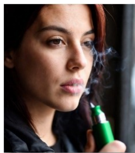
"Reducing Vaping Among Youth and Young Adults," the information is at: library.samhsa.gov/sites/default/files/pep20-06-01-003.pdf

A cross the United States, roughly 5–6% of minors (middle and high school students) currently use e-cigarettes, according to recent national surveys—that's about 1.6 million youth. In Canada, about 7-8% vape. Research has shown that youth who vape risk chronic nicotine addiction, lung damage, and an increased risk of heart damage and stroke, and later, they're more likely to smoke cigarettes and use marijuana. New information from the U.S. Drug Enforcement Agency to help you understand vaping, its harms, and how to prevent and intervene in its use is now available for parents and educators.